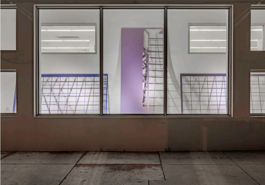
Left image: Walgreens 67th street and Collins Avenue, Above: Walgreens 67th Street

Transformation and Futility: a queer deconstruction of space