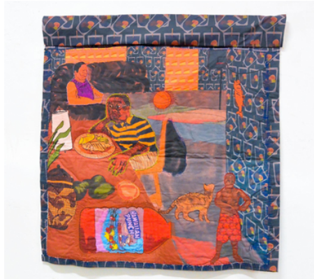
Mark Fleuridor Adventures of Mako 2 , 2020